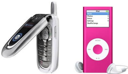
cell phones and mp3 players