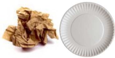
soiled paper products