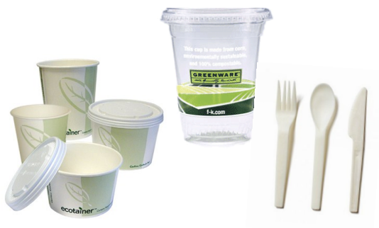
biodegradable containers and utensils