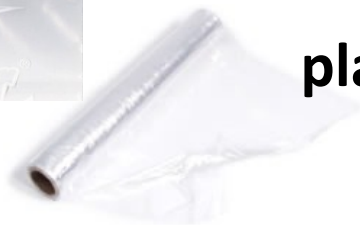
plastic food storage