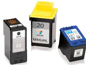
ink and toner cartridges