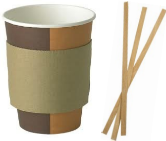
coffee cups and stirrers