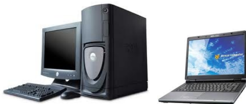
laptops and computers