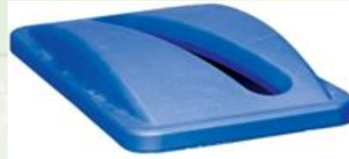
Paper and Cardboard Lid